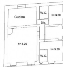
PIANTA PIANO TERRA